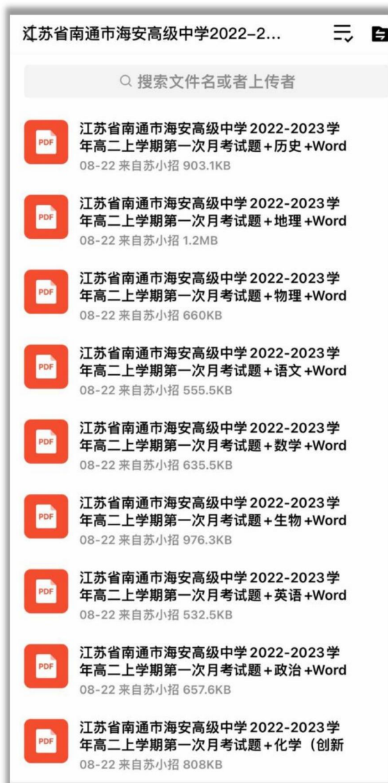
(招考网 qq 群资料)

如需第一时间获取相关资讯及备考指南，欢迎加入江苏招生考试网建立的【江苏高考交流群】，群内会分享一手高考资讯、往年真题、学习资料、综评、强基、志愿填报等干货及答疑，群内还有不定时福利发放哦，快加入吧！